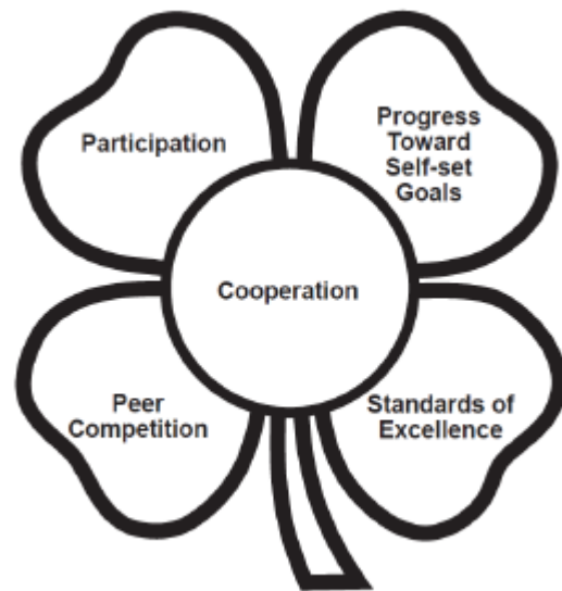
National 4-H Recognition Model

The purpose of recognition in 4-H is to encourage and support the efforts of our members in learning to improve their knowledge and develop life skills. It is important to recognize 4-Hers in five areas: participation in educational experiences, progress towards personal goals , recognized standards of excellence , peer competition , and cooperation .