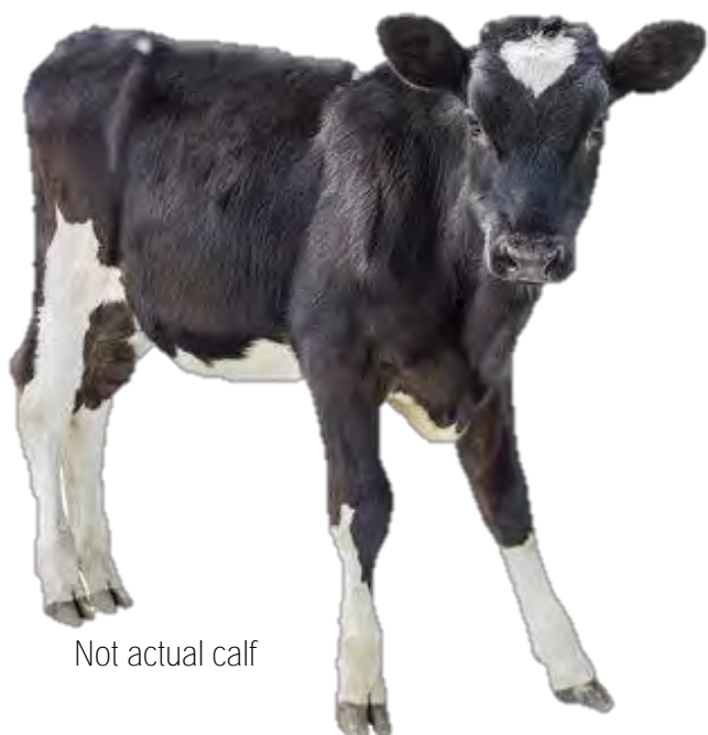
Not actual calf